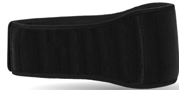
[ Side View ]

Ease everyday muscle aches and pains with the latest advanced Graphene Far Infrared (FIR) heating technology.